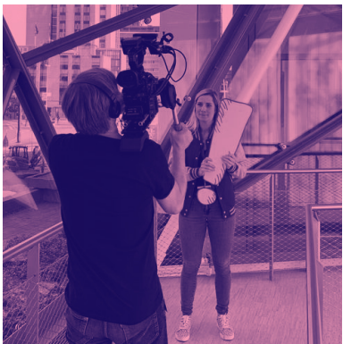
Filming at de Volksbank: reporters are gathering stories with real Impact