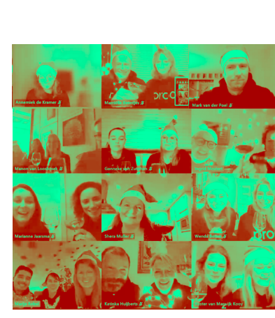
Separated but together at Christmas