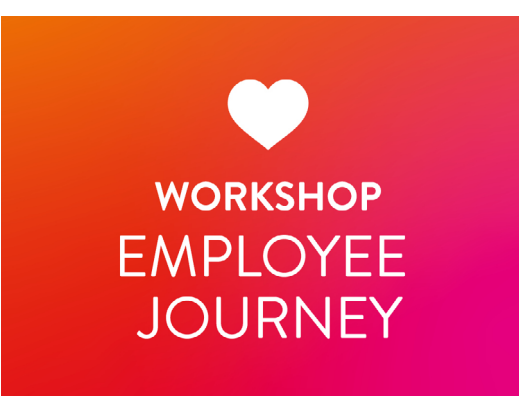
Improve the employee experience together with your colleagues during our workshop