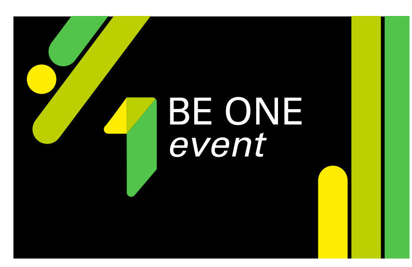
Enza Zaden: Be One event Connecting leaders from all over the world to discuss the Group Strategy 2025