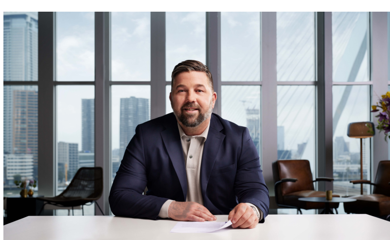
Croonwolter&dros: Working at a top club Attracting new technical talent by bringing the concept of a top club to life on billboards, social media and the radio with the help of former footballer Theo Janssen