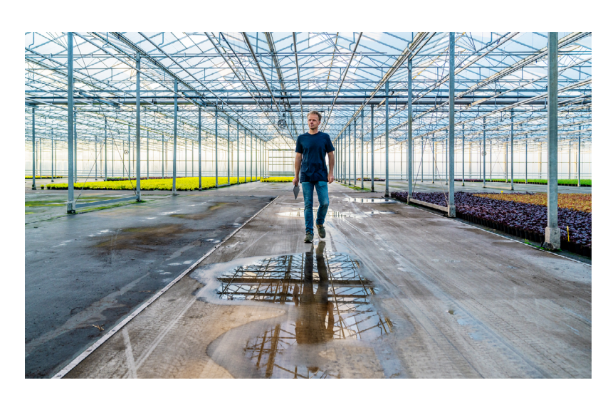
Royal Flora Holland: Connect to grow Inspiring and supporting employees and managers in mastering the desired behaviour in line with the organisation's core values