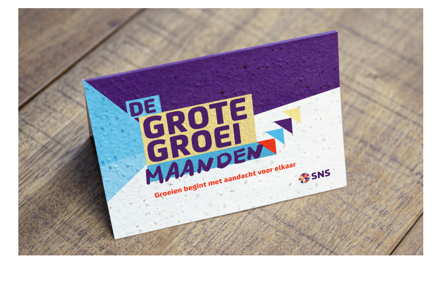
SNS Bank: The Great Growth Months Bringing the brand's repositioning to life internally by focusing on the individual growth of each employee