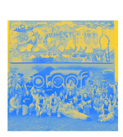
The PROOF team paints Amsterdam in PROOF style